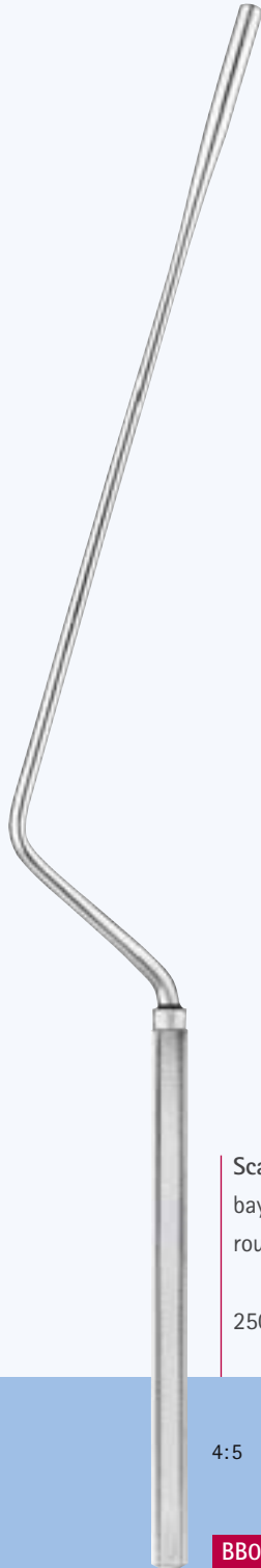
Scalpel handle, bayonet-shaped, round handle